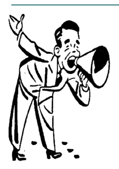
Announcements & Tidbits

(details on page 4 and at December membership meeting)