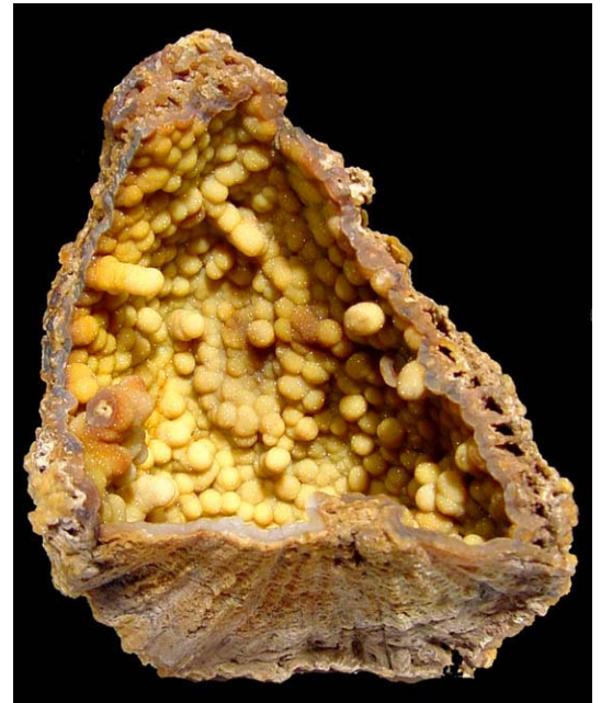
Withlacoochee/Suwannee river beds.

In Florida, agatized coral is found in three main locations: (1) Tampa Bay, (2) the Ecofina River in the panhandle near Perry, Florida, and (3) the With-