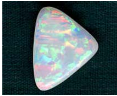
Spencer Opal Top image courtesy of gemstoneworld.com; bottom image courtesy of facetgems.com. Images used for educational purposes under the provisions of the "Fair Use Act of 1976."

meant "precious stone." To combine the derivatives of the opal name, opallios upala, would yield the meaning, "to see a change of color precious stone." Opal has been a treasured gemstone for centuries. Romans adored the opal as a token of hope and purity. Greeks thought that opal yielded foresight and prophecy. Arabs thought that it was a gift from heaven, and Asians viewed it as sacred.