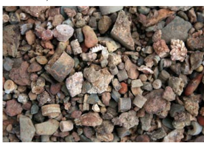
Dale Hollow Lake, Tennessee