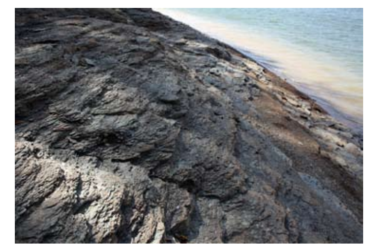
Dale Hollow Lake, Tennessee