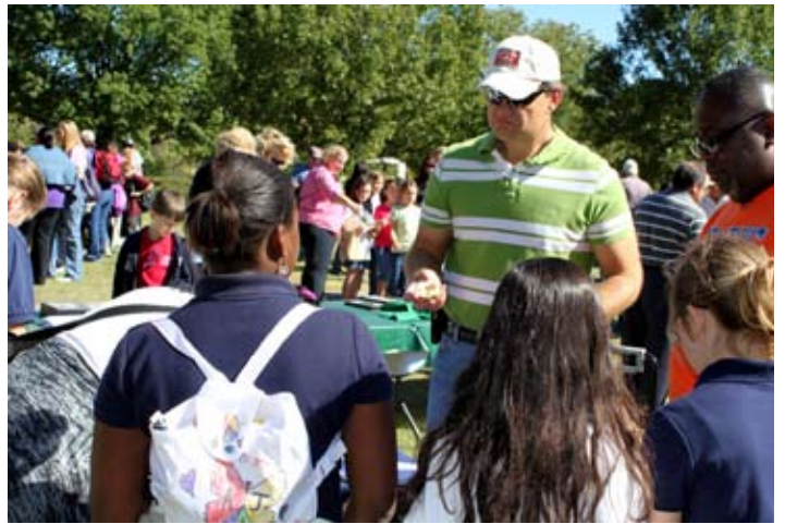
Learning about rocks and minerals