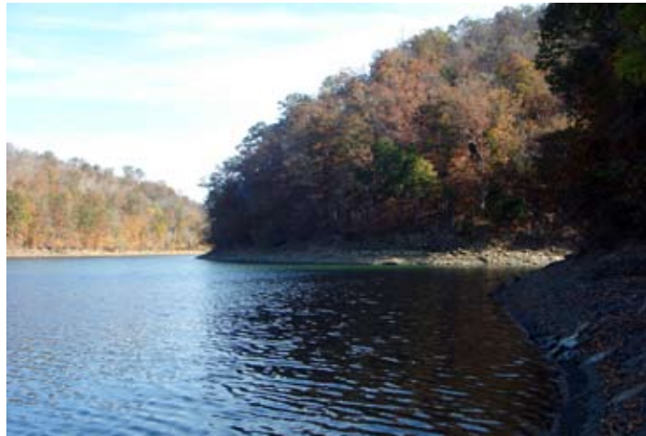
Dale Hollow Lake, Tennessee