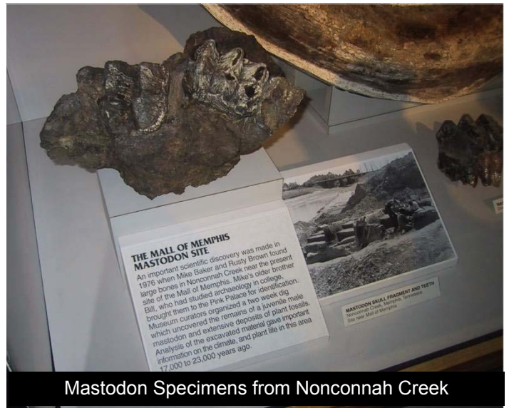
Mastodon Specimens from Nonconnah Creek