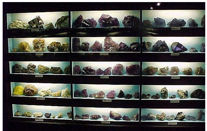
A display wall at the Clement Mineral Museum.