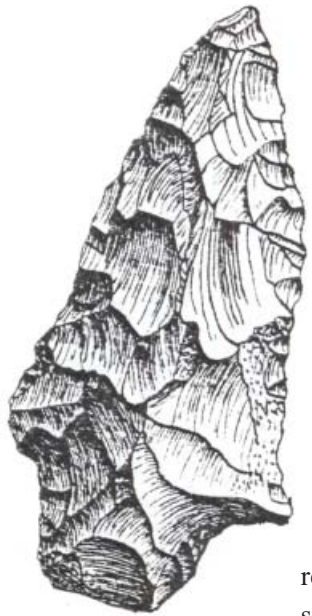
Arlington Point Late Woodland Period, 450 BC Image is actual size<sup>2</sup>

When the last great Ice Age still held the world in its frozen grasp, human beings first gazed upon the green valley of the Tennessee River. Fifteen thousand years ago or more small bands of nomadic hunters ventured into the untrodden wilderness that had never known the sound of a human voice, leaving behind little evidence of their existence.1