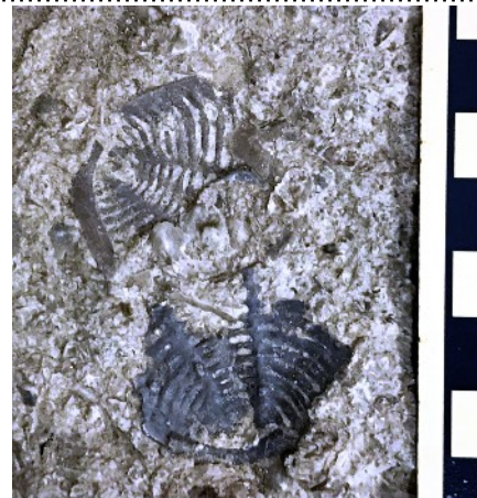
Figure 2. Inner surfaces of two pygidia of Dalmanites retusus from the UT Martin collection. Each black & white block 1 cm in length.