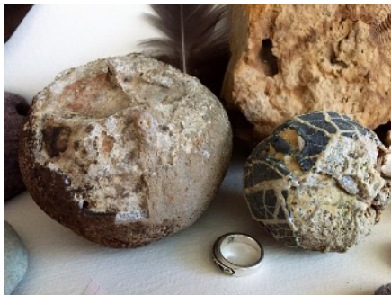
Two loboliths from Horse Creek showing different forms of preservation. The larger is calcite recrystallisation and the smaller has chert nodules and threading.

September Program for sale. These Continued from P. 1 specimens, however, are only of the crinoid crowns, where all the major functions of life occur. The specimens that are found in Hardin County, Tennessee, are of the loboliths, which are their unique form of holdfast (often thought of as the roots). The lobolith has long been a source of mystery for paleontologists. They have been interpreted a being a variety of things, including other echinoderms, cysts, and brood pouches. They were even given their own genus Camerocrinus . Today they are known to be holdfasts but the current mystery is how they were used. The competing hypotheses are: they allow the crinoid to float (the inner chambers would have been hollow in life) or they were just a specialized holdfast to allow for living on more muddy bottoms.