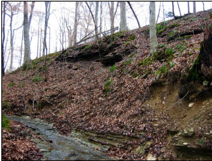
A tributary of Horse Creek. The lower layers are the Birdsong Shale, where the loboliths are found.