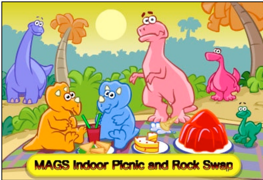
MAGS Indoor Picnic and Rock Swap

August 14 MAGS Meeting—Food, Fun, Prizes, Things to Buy