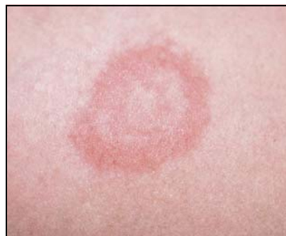
Lyme Disease often starts with a red rash in the shape of concentric circles.

Mosquito repellents that contain only "Deet" don't work on ticks. Have fun outdoors, but be safe!