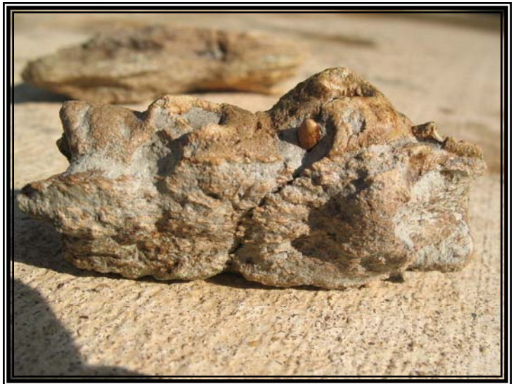
Photo sources: (1) http://crossroadsjournalismcentre.com/images/Feature_articles/mosasaur/mosasaur_nhm.jpg (2) http://www.piinc.biz/librarymosasaur.htm (3) Photographs taken by Dan Reed

Sources: (1) Wikipedia.com ; (2) http://www.piinc.biz/librarymosasaur.htm