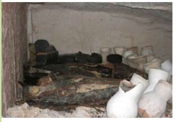
Inside the burial chamber of KV 63

The entrance to the new tomb is located just to the east of the entrance to the tomb of Amenmesse (KV 10) and about 25 meters south of the tomb of Tutankhamon (KV 62). The tomb consists of a vertical shaft and a chamber directly adjacent to the shaft. The burial chamber holds seven wooden anthropoid ("human-shaped") coffins with painted faces, about twenty pottery jars, and other materials that will come to light as the clearing of the tomb progresses.<sup>01</sup>