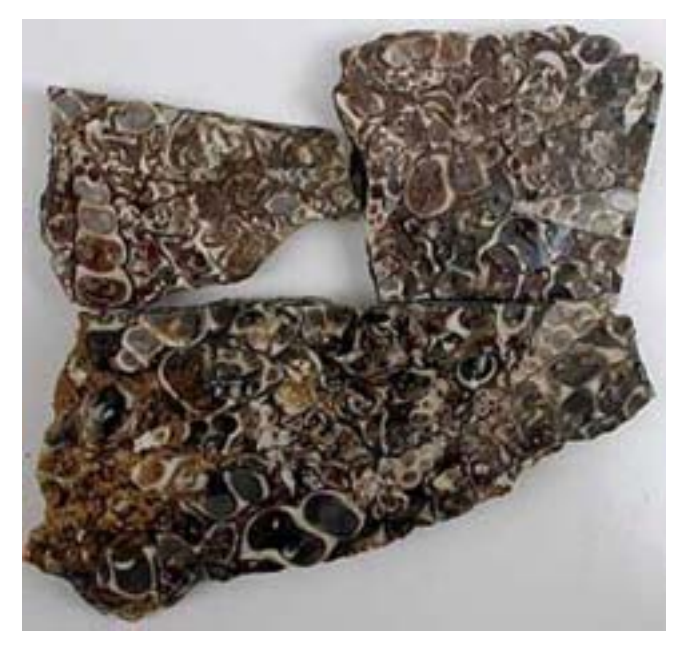
Turritella Agate . . . or more appropriately, the Oxyterma Agate.

From Snoopy Gems, February, 2004 via MAPS Digest and Show-Me Rockhounds Newsletter.