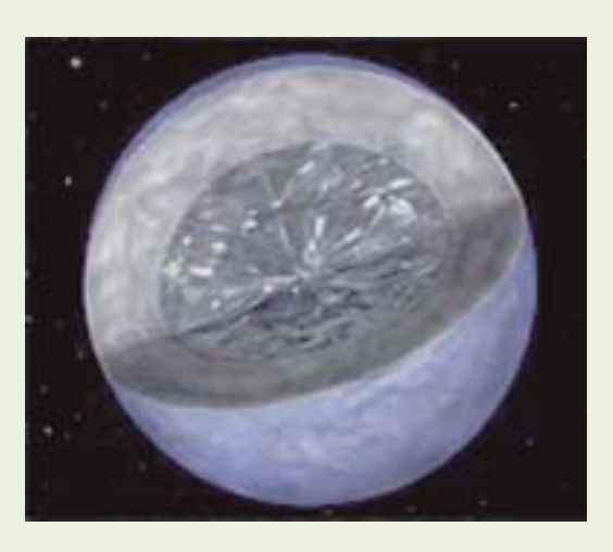
Lucy, Largest Known Diamond

In a typical-sized white dwarf star, crystallization of the core would not begin until the surface temperature reaches 6000-8000°K. In more massive white dwarves, this crystalizing effect would begin at higher surface temperatures. The largest white dwarf presently known is BPM 37093 [Lucy]. By watching the pulsating movements of this star, astronomers can determine the size of it's crystallized core.