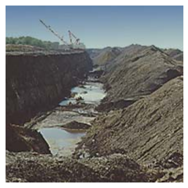
Modern Surface Mine

US DEPARTMENT OF THE INTERIOR: Whether hiking, camping, hunting, 4-wheeling or simply just enjoying the countryside, outdoor activities are a source of enjoyment for millions of Americans each year. But outdoor recreation also requires cautionespecially near abandoned mines.