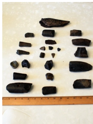
Dugong bone, turtle shell, snake vertebrae, inner ear bone

The geologic formation is likely the Hawthorn Group, Peace River Formation, Bone Valley Member which ranges in age from