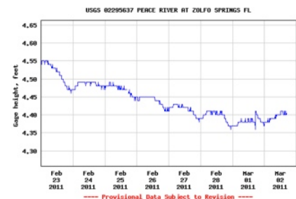
Sample graph, Peace River water level

After several years of false starts, finally this February we got our chance to fossil hunt in the Peace River. The weather was great and the river was low. We waded in and put a shovel of sand in our screen. Wow! Small shark teeth! We were hooked. We had such a great time that we would go again at a moment's notice.