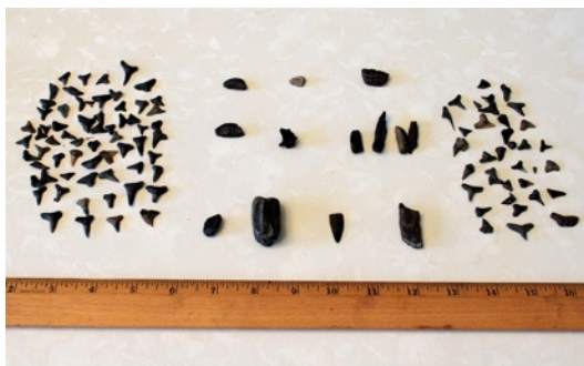
Shark teeth, sawfish tooth, horse teeth, puffer fish mouth plates

There are several places to access the river easily: A boat dock in Gardner, campgrounds at Zolfo Springs, and a park in Brownville. If you plan to go there are a couple of things you need to know. If the river is higher than 6 feet at the Zolfo Springs gage it will be very difficult hunting. The river's current will be too strong. The Tampa Bay Fossil Club recommend that you fossil hunt the Peace River December-May, Continued, P. 4