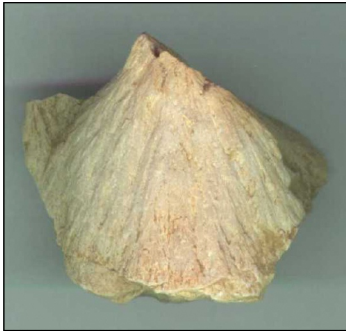
Figure 1. Shattercone. Wells Creek Basin.

Sometime between 100 and 300 million years ago, a violent event occurred in what is now Wells Creek Basin in Stewart and Houston Counties of Central Tennessee. A bright light appeared and streaked southward across the