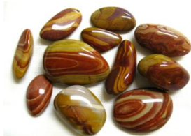
2010 Winning stones