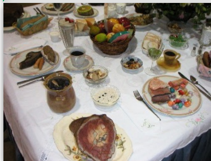
Table (above). The table has been a yearly display since the 1980s. I am aware of one other active food table display. Who came first was unknown to me until I ran across this article published in December 20, 2018, on this website ( How the Tucson Shows Got Their Start ):

https://www.interweave.com/article/jewelry/tucson-shows-got-start-history/