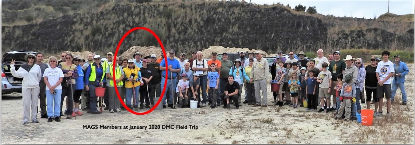
MAGS Members at January 2020 DMC Field Trip