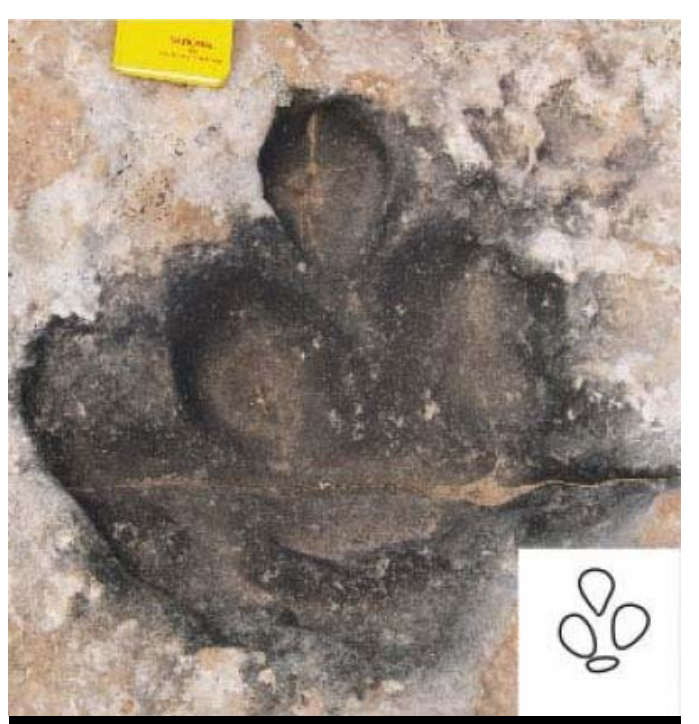
This Eubrontes dinosaur footprint, including three toes and a heel, measures roughly 16 inches (41 cm) long and is thought to have been made by an upright-walking meat-eater. (The inset outlines the footprint shape.)

By studying the shapes and sizes of the tracks, Seiler suggests four dinosaur species gathered at the watering hole, though the researchers have yet to match the prints with specific species. Currently, the tracks are named for their particular shapes and include: