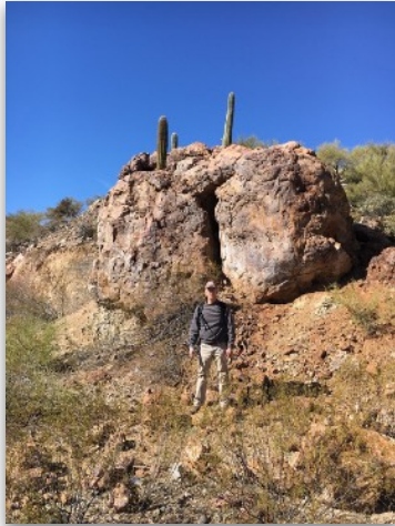
Looking For Wulfenite