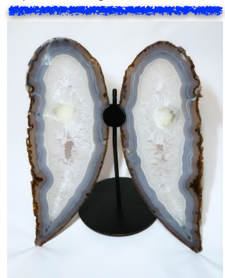
2020 Show Grand Prize—2021?