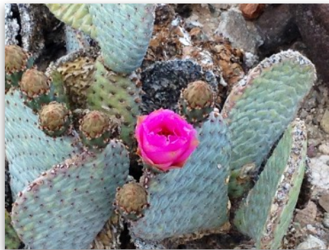
Prickly Pear Bloom