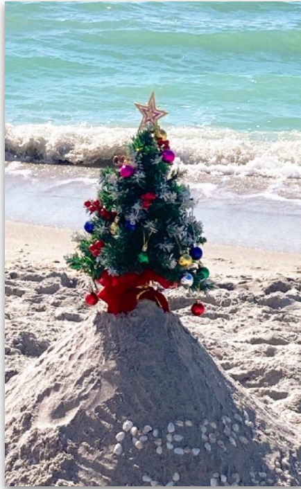
White Christmas (the white is quartz)