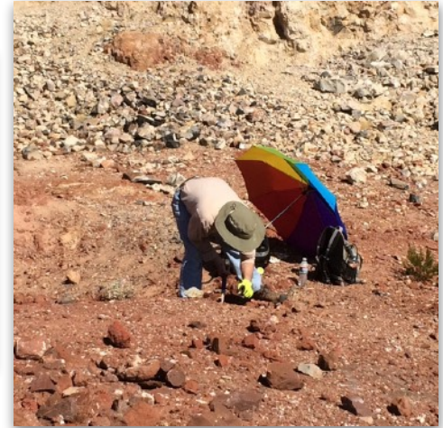
Looking for Geodes at Hauser Geode Bed