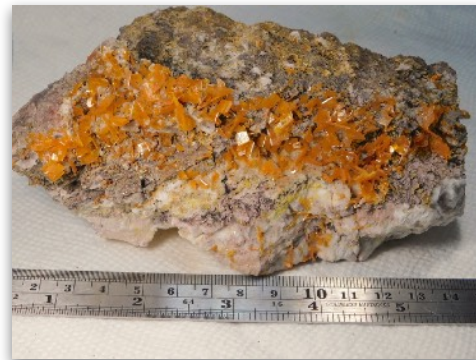
Mammoth Mine Wulfenite