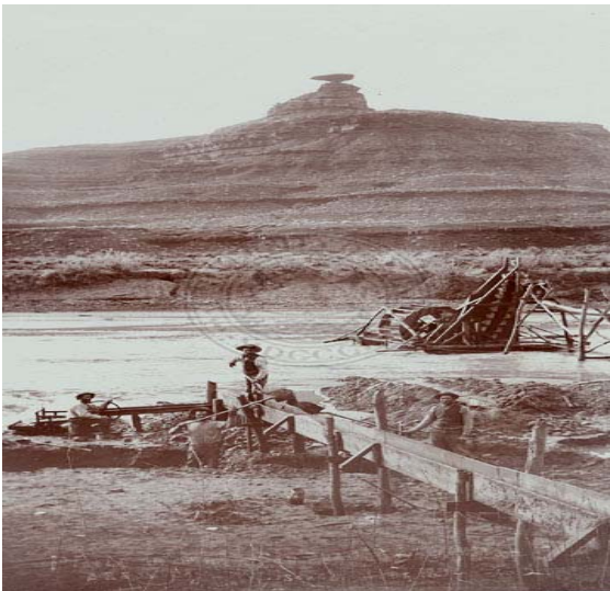
Mexican Hat or Balanced Rock in the background of placer miners. View in Oil Basin, 25 miles west of Bluff, Utah."

Everyone has heard the phrase, “A picture is worth a thousand words.” Explore mining and history through digitized photographs